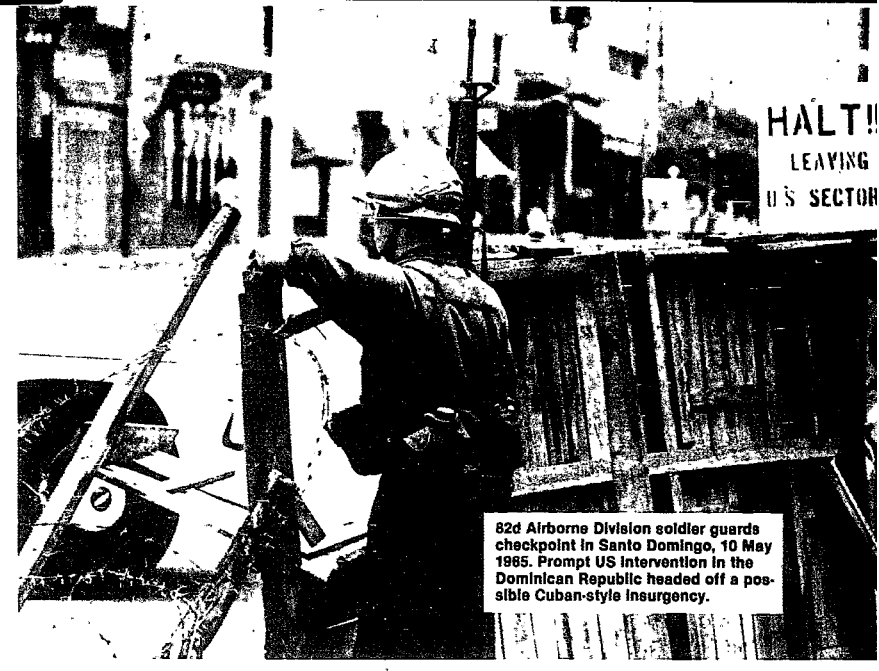
Appropriate action, taken rapidly and resolutely, will normally defuse the insurgency. If the insurgents have little popular support and fail to cause confusion and repression by the government, the insurgency will die...

Soviets are called upon to defeat anticommunist rebels in such diverse places as Cambodia, Nicaragua and Angola. What sort of help do these nations really need?