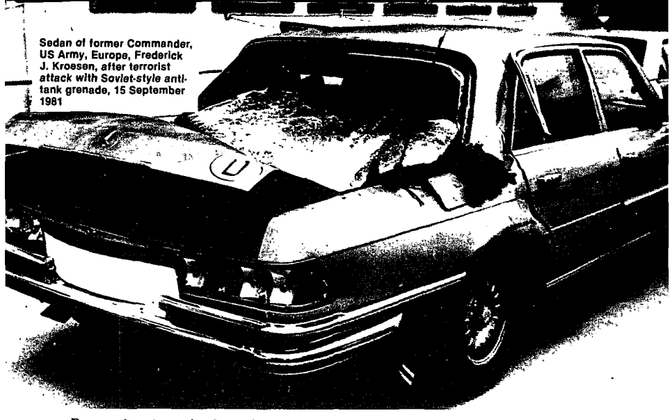
Poverty is not a major factor in creating an insurgency, nor does material wealth prevent one.... Comparatively wealthy countries with extensive social programs, such as Germany and Italy, are plagued with terrorism, and middle-range countries like Argentina and Lebanon are wracked by insurgent warfare and terrorist campaigns.

legitimacy of new governments. Many do not share a common history, language or faith but, rather, are composed of disparate ethnic and religious groups often at odds with each other. There is a tendency toward both separatism and revolutionary action aimed at putting a particular group "on top." Continued struggles for ascendancy often lead to repression and violence which, in turn, increase the ranks of those having serious grievances with the regime and no legal means of redress. Some of these disenchanted people, because of temperament, personal loss or a sense of obligation, become active or sympathetic supporters of insurgent movements.