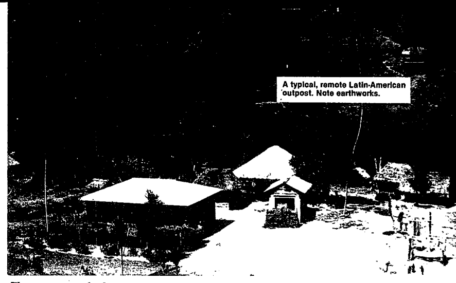
The army must also be psychologically prepared to do something most armies hate--garrison duty. The army has to . . . convince the villagers that the government is ready and able to protect them.

and gunships to concentrate on rifles, machineguns, armored cars and utility helicopters, they will be unable to "find, fix and fight" their elusive enemy.