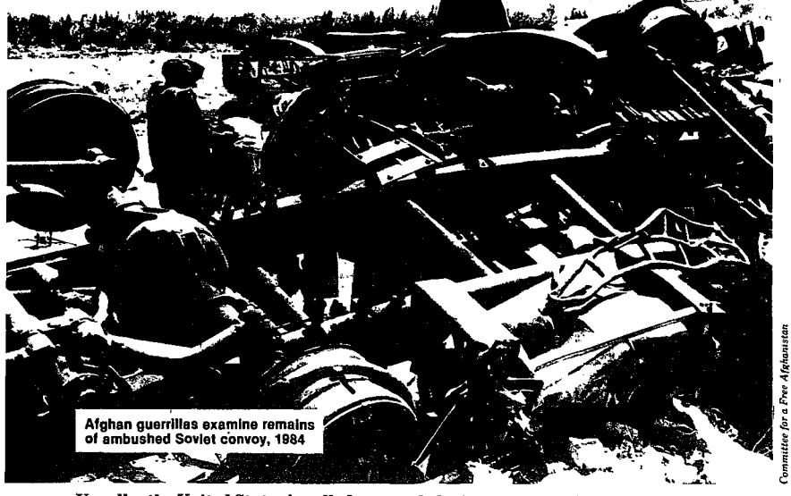
Usually, the United States is called upon to help defeat communist rebels but, increasingly, the Soviets are called upon to defeat anticommunist rebels in such diverse places ac Cambodia, Nicaragua and Angola.

Currently, US training for foreign nations tends to stress conventional warfare activities such as close-air-support coordination, artillery preparation of attack zones and large-scale troop movement. As a result, these foreign troops are welltrained—for a land war in Korea or Central Europe. The only useful training they have received is in the area of small-unit tactics and light infantry weapons. This training may not have been of sufficient length and intensity to prepare them for the appropriate type of operations.