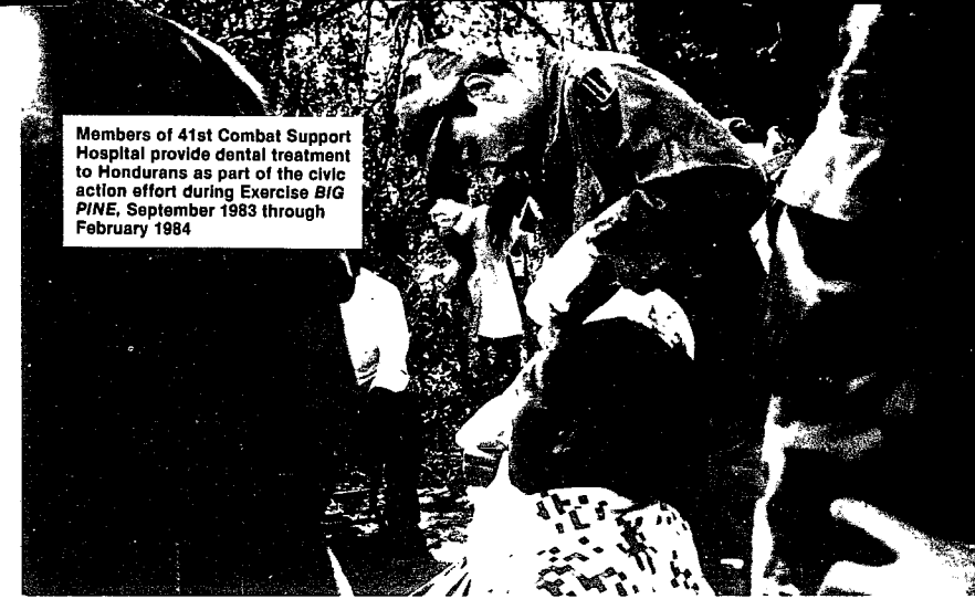
Another area causing problems is cultural. US aid usually is accompanied by US demands for social, political and economic changes the smaller nation may not want, and sometimes the aid is seen as a bribe to ensure compliance. The United States must avoid falling into the trap of being feared and distrusted by the people we seek to help.

surgents, the internal problem must be faced by the local government. The United States can train officials and troops and can provide equipment for effective mobility, communications and firepower, but the officials and troops must prove themselves worthy of the support of the people.