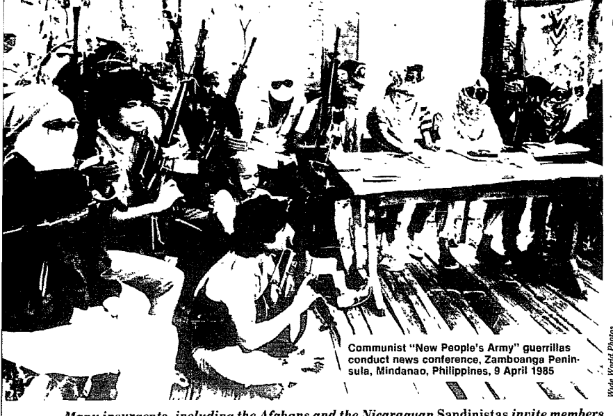
Many insurgents, including the Afghans and the Nicaraguan Sandinistas invite members of the news media to join them 'in the bush,' reporting on their life, activities and dedication to their cause.

long-term hopes for success, insurgents need popular support and frequently support from foreign governments. To obtain it, they need to make their presence felt.